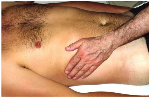
Fig. 4 Stage four, the shake movements in line with armpit from top to down and vice versa

and this amount was returned to the stomach with any amount it has, and a certain amount of food was gavaged into the stomach in such a way that the final volume in each patient should reach 300 cc.