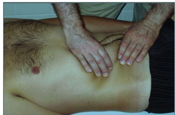
Fig. 3 Stage three, the abdominal skin shape is changed with rubbing

Patients hospitalized in intensive care unit were gavigated every 3 h according to the protocol, and the studied patients were fed in the same way. First, using a special 50 ml gavage syringe, 5 cc of air was quickly injected into the stomach, and using a stethoscope, the voice in the stomach was heard, and after confirmation of the insertion of the NG tube, first lavage was performed and the gastric volume residual was measured,