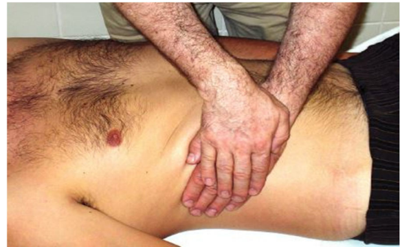
Fig. 2 Stage two, the dominant hand is placed on the abdominal skin and the other hand on it with appropriate pressure, the skin is drawn

abdominal skin is elastically deformed by massage, the abdominal skin is picked, and kneaded by the fingers (like kneading dough) (Fig. 3). The fourth stage involves shock movements along the armpit from top to bottom and bottom to the top (Fig. 4), and the last stage contains deformation of the muscles in the intercostal spaces of false ribs (the fingers are placed between the intercostal spaces and pulled on the skin with an appropriate pressure) (Fig. 5); the lubricant gel is used to facilitate the massaging. The patient's position is asleep to the back while undergoing massage. The angle between the bed and the patient's head is 30 to 45 degrees, and the patient's legs are placed on a pillow. This condition helps to relax the abdominal muscles.