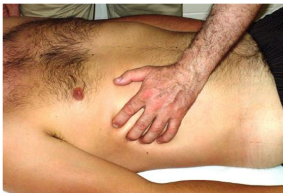
Fig. 5 Stage five, the fingers are placed between intercostal spaces and pulled appropriately

After confirmation of the insertion of NG tube into the stomach, lavage was performed for each patient at 8 am, and the GRV was measured and recorded, then this