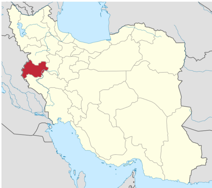
Fig. 1 Map of Iran; Kermanshah province is marked in red.

This cross-sectional study was carried out in Kermanshah, Iran, and was based on the STROBE guideline. The research tool was a researcher-made checklist containing 11