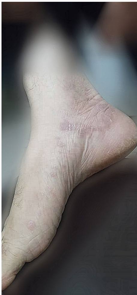
FIGURE 2 Lichen planus lesions of the patient's leg and ankle

Furthermore, exacerbation of the pre-existing lichen planus has also been observed after COVID vaccines. 23 The pathophysiologic mechanism might be the T_{H1} response that is elicited by the vaccines, which in turn leads to the elevation of interleukin-2 (IL-2), tumor necrosis factor- \alpha (TNF- \alpha ), and interferon- \gamma (IFN- \gamma ) levels, and therefore, lichen planus induction. 25 Our patient did not point out any of the risks mentioned above, and her past medical and medication history was not significant. Antimalarial agents are the most critical medications involved in the rising up or exacerbation of lichen planus, but our patient had not received hydroxychloroquine to treat her SARS-CoV-2 infection. In addition, her laboratory tests showed a negative serology for hepatitis B, hepatitis C, and HIV. The result of the SARS-CoV-2 RT-PCR test was also negative.