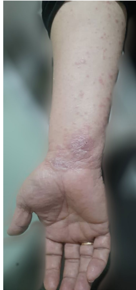
FIGURE 1 Lichen planus lesions of the patient's forearm

Lichen planus is a chronic, inflammatory, autoimmune dermatologic disorder that involves the skin and mucosal membranes. Cutaneous lesions usually present with planar, purple, polygonal, pruritic, papules, and plaques, known as the six Ps. Mucosal surfaces that are commonly affected include oral and genital mucosa. Moreover, skin appendages such as nails and scalp hair are sometimes engaged. 6 Lichen planus frequently presents acutely and involves the flexor surfaces of the upper and lower extremities. 7 Its cutaneous lesions are often covered by Wickham striae, manifested as reticular purple pruritic papules and plaques in flexural areas and oral lesions on the lips and