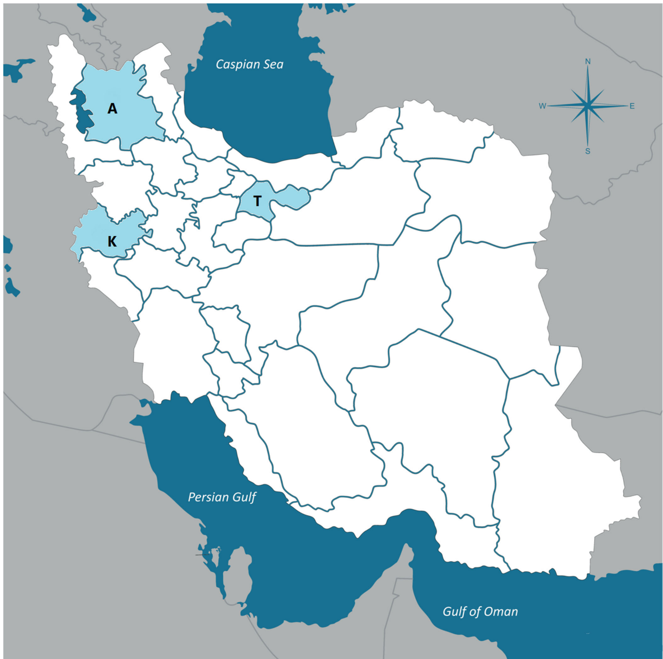
Fig. 1 ARAS Recent onset Acute phase pSychoSis Survey catchment area. Map of Iran, showing the three collaborating centers in ARAS cohort as east Azerbaijan (A), Tehran (T) and Kermanshah (K).

adapted version of the Stark and Glock's dimensions of religiosity to the Islamic religion was used as a measure of religiosity 27 . The Internalized Stigma of Mental Illness scale (ISMI), gave an estimation of stigma in the study sample 28 .